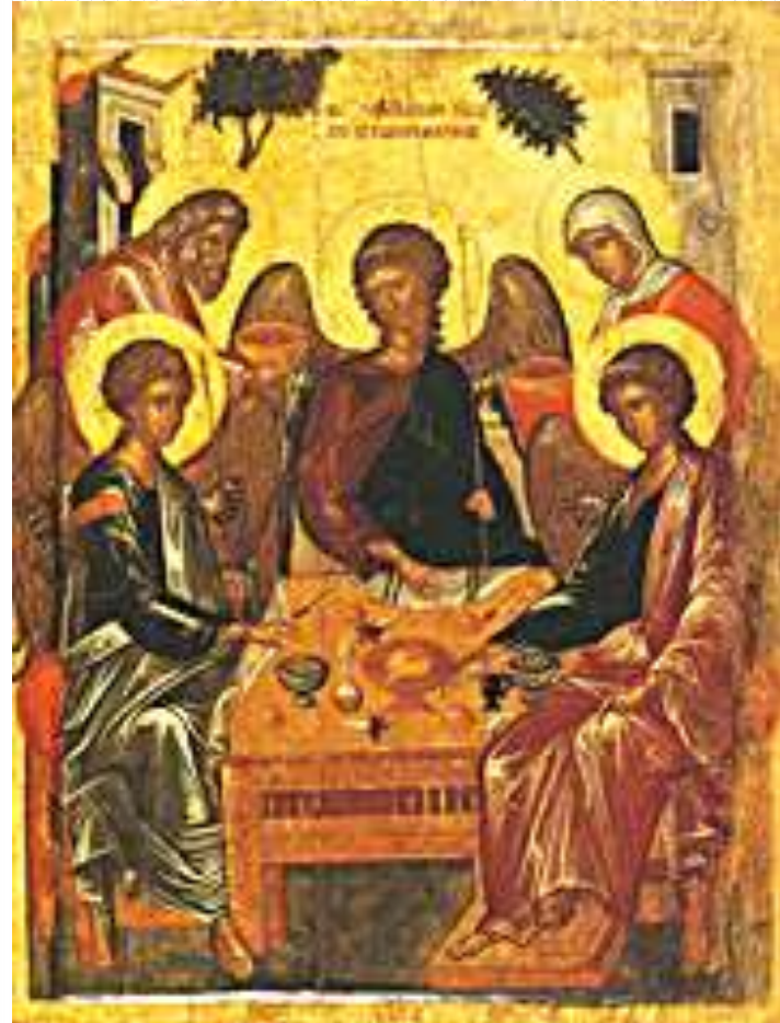
Hospitality of Abraham (Cretan, 15th c.)