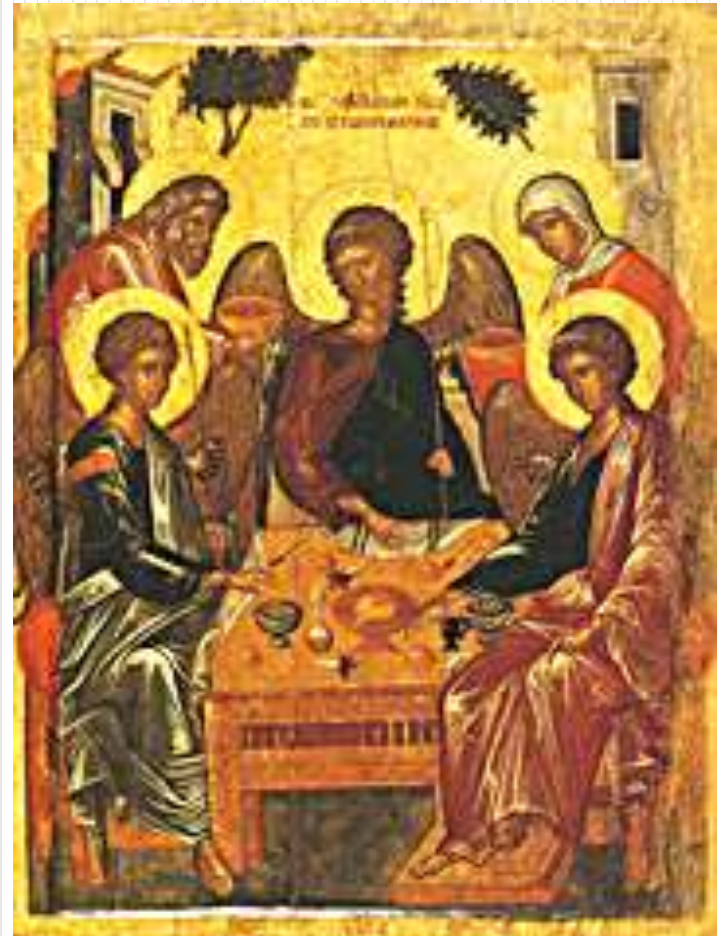
Hospitality of Abraham (Cretan, 15th c.)